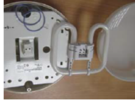
The Type Of Light fitting